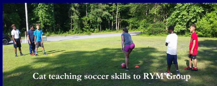
Cat teaching soccer skills to RYM Group