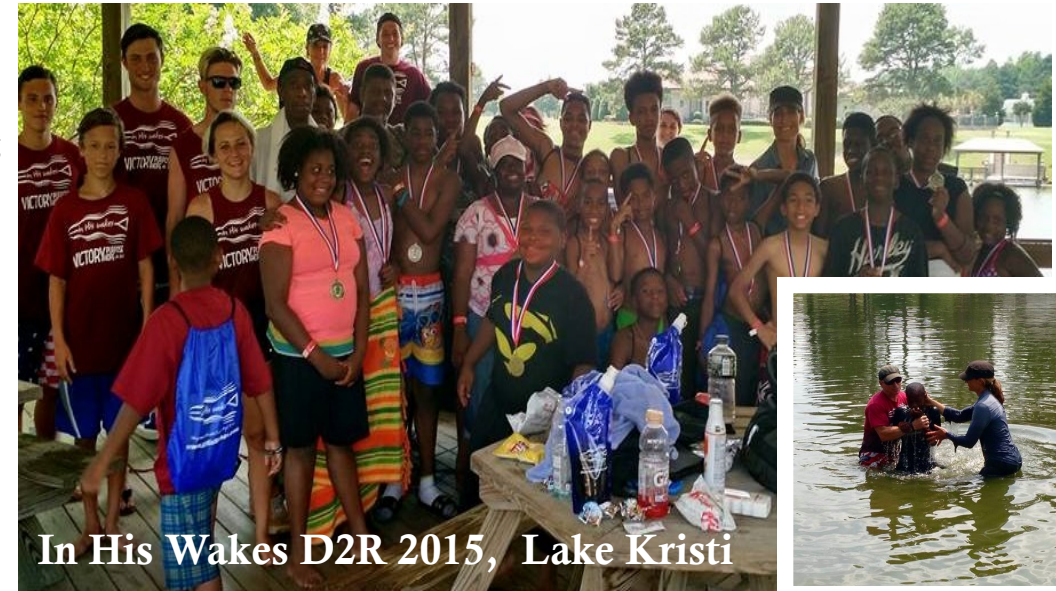
In His Wakes D2R 2015, Lake Kristi

“Me and my sister can’t go because we don’t have the right supplies...”, a long face told me as we waited anxiously for the last two campers before heading to Lake Kristi. “The right supplies?” I asked. “Yeah, like a bathing suit, towel and stuff.” “It’s ok, just go grab an extra change of clothes and tell your mom you will be fine!” Off to Lake Kristi we went in a van full of children excited and nervous for what was soon to be a “Day 2 Remember”, especially for one young boy who thought he would never experience it.